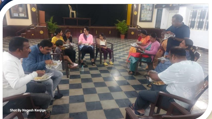
Shot By Nagesh Kenjige